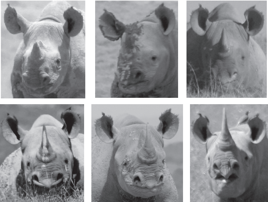
Rhino 1 female born July 2011; photos from October 2012 to July 2016.