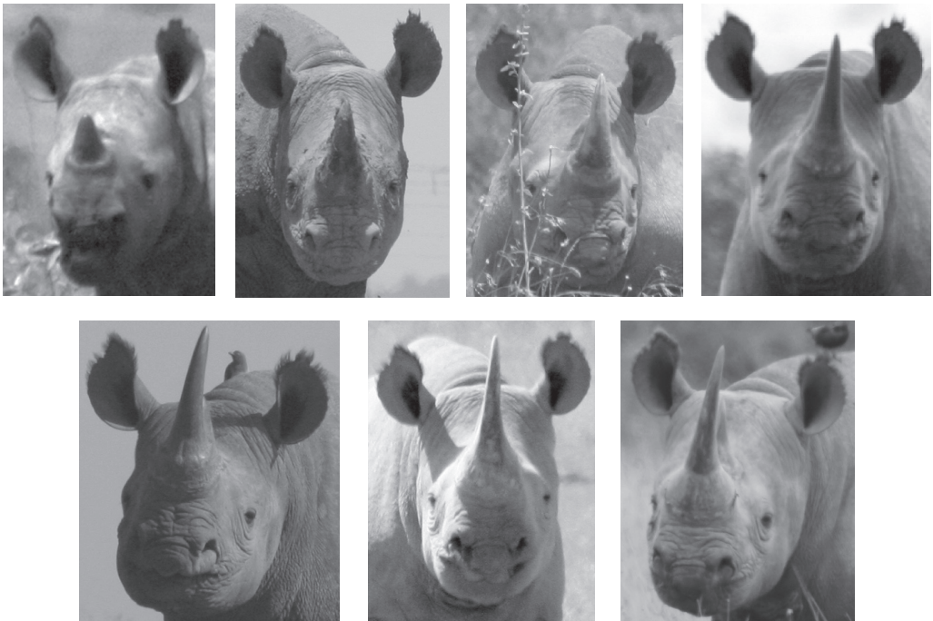
Rhino 2 male born October 2009; photos from August 2010 to July 2016.